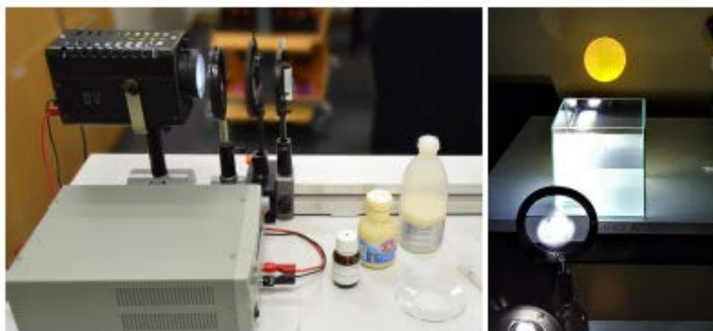
Figure 6.3.1: Set-up of the experiment with a xenon lamp, a diaphragm and an achromatic lens. In between a filter holder is placed. The aquarium is illuminated and the transmitted light is shown on a wall.

As a “real world” experiment, the formation of secondary organics aerosols can be studied, which are generated through the reaction of limonene with ozone. The equipment for the experiments is now available in a suitcase, which can be borrowed from schoolteachers together with a manual for educational purposes, to be used in schools.