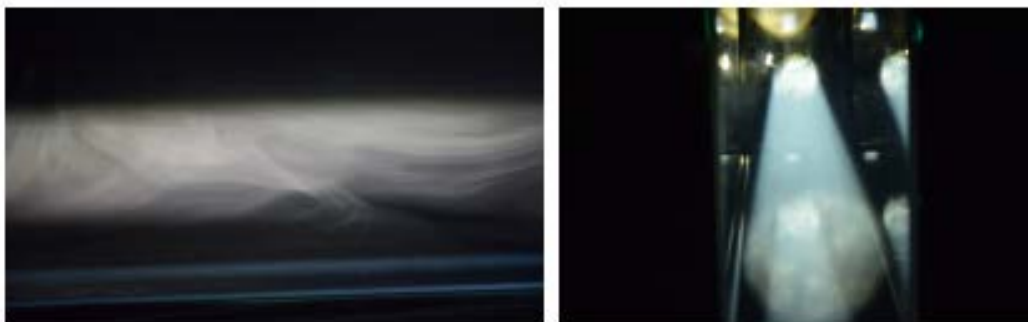
Figure 6.3.3: Stray light in limonene: 90° to the direction of light propagation the fog is the rather white, contrary to the propagation direction where a blue colour is visible (all pictures taken from 1) ).